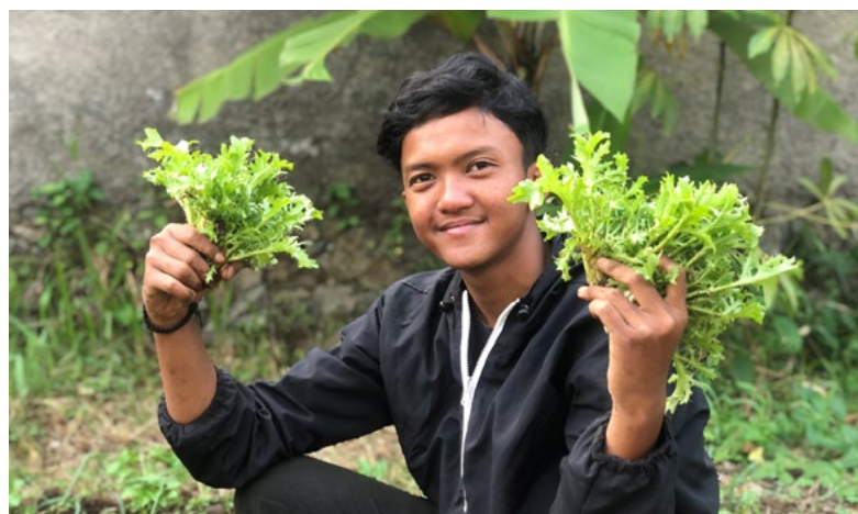
Seni Tani volunteer demonstrated how they run their community garden.

West Manggarai has been identified as a priority area for tourism development. Dependency on the food supply from Java is a challenge, therefore, food production and diversity (less focus on rice, more on vegetables and traditional crops), as well as food security are key areas for attention to fully realize the potential of tourism. Waste management is also a critical concern. Main local products are rice, grains, beans, coffee, tubers, moringa and fish (the latter being promoted in the "Gemar Makan Ikan" – "Love to eat fish" campaign). West Manggarai is also famous for its coffee. This all provides ample opportunities for business and jobs. However, youth has little role and interest in the food sector, while the tourist sector does not yet provide sufficient opportunities either. As a result, many migrate away from the region.