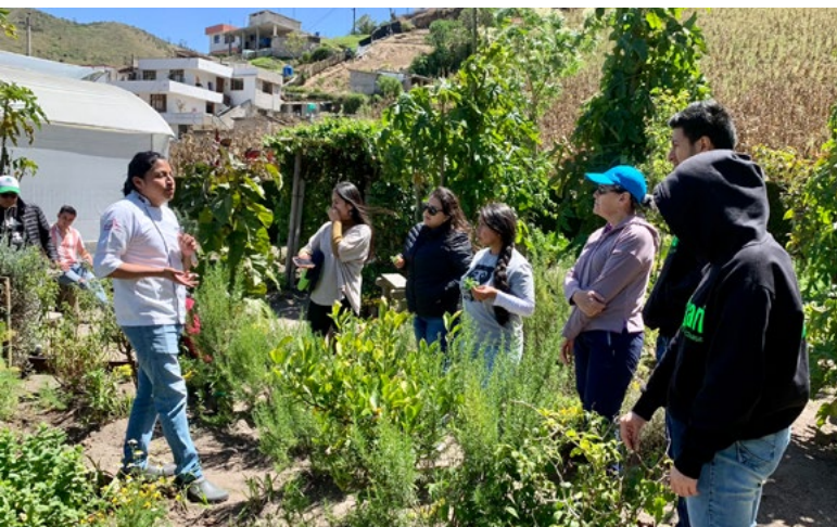
Young local chef from the Andean Chocó harvests from his diverse vegetable garden to cook for clients at his thriving gastronomic enterprise.

Urban Futures will collaborate and align with the Quito Metropolitan District Municipality and the Chocó Andino Biosphere Reserve Management Committee, as well as local producers, civil society organizations, youth movements and academics, that seek to reverse the depletion of the area and promote the ongoing transition towards diversified systems of sustainable production, such as regenerative agriculture and tourism. This will be done with national, provincial and local authorities and with universities, NGOs, for example, the Imaymana Foundation and CBOs, such as the Chocó Andino Youth Network, which is the most important in the territory, and the Chocó Andino Sustainable Food community linked to Slow Food Ecuador.